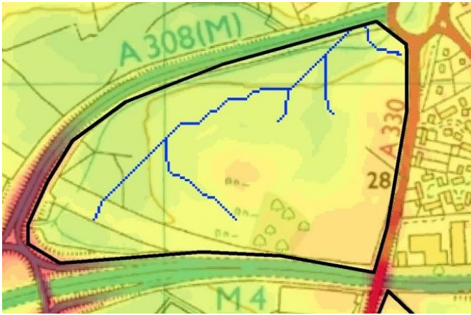
Figure 1. The Cuts DTM and flow pathways (blue lines) for HA9.

The Digital Terrain Model (DTM) ground levels range from 21m AOD (spot height in dark green) to 33m AOD (spot height in red) taken from an airborne survey and is accurate to +/- 0.3m.